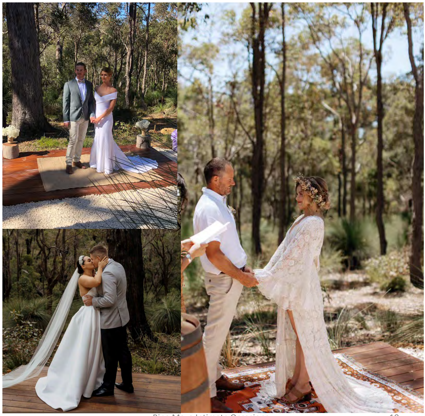
Bina Maya Intimate Occasions